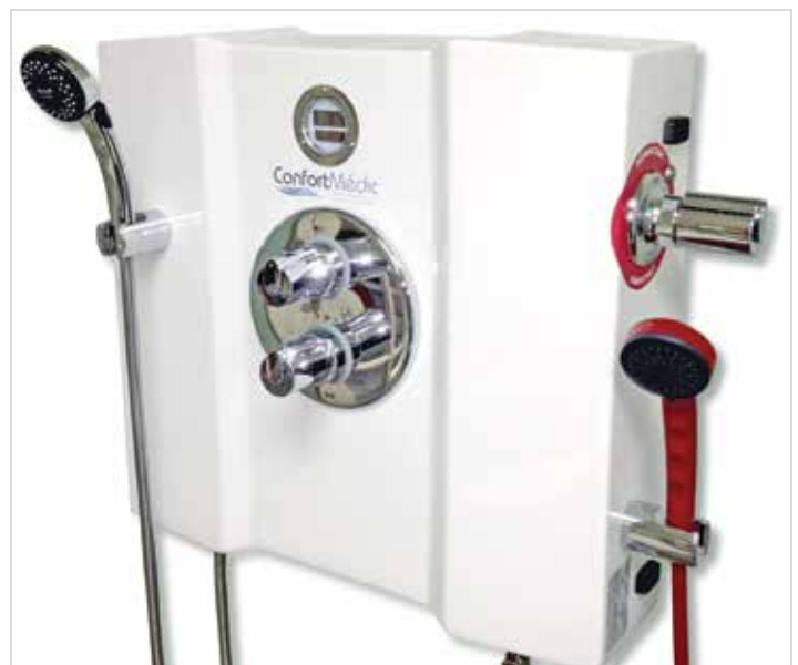
CPC1000 shower panel with disinfection system and digital display of water temperature.