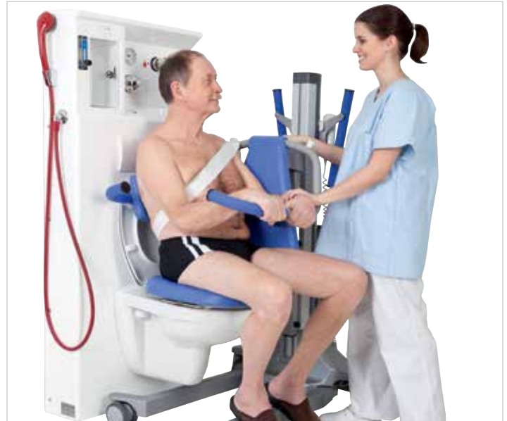
Easily used in combination with a seat lift for visits to the toilet.