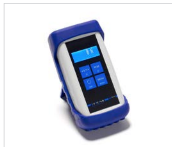
Digital scale with patient weight display.