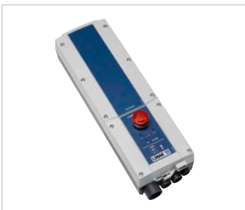
Linak control box with removable batteries.